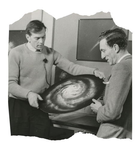
Astronomer Martin Ryle and television presenter Raymond Baxter, 1960, RYLE K.115.

Highlights of his collection include the 1965 papers of the 'Working Group on Proliferation', intended to advise the Minister of State for Disarmament (BLRD E.38).