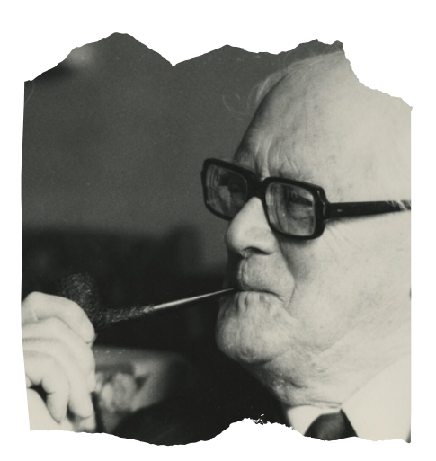
Fenner Brockway in 1977, FEBR 7/69.

Highlights include <u>NBKR 5/64</u> which includes correspondence between Noel-Baker and Quaker peace campaigner Elisabeth Rotten regarding disarmament, and <u>NBKR 5/21</u> which includes Noel-Baker's correspondence with the 'Women for Disarmament' group in 1976.