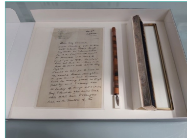
Bespoke mount and box for the Armistice pen

More interventive work has included treatments on very badly mould-damaged paper in the collections of Julian and Leo Amery (AMEJ and AMEL). The very fragile paper is stabilised by using facings of very thin, pre-adhered Japanese paper while missing areas are infilled with thicker Japanese paper.