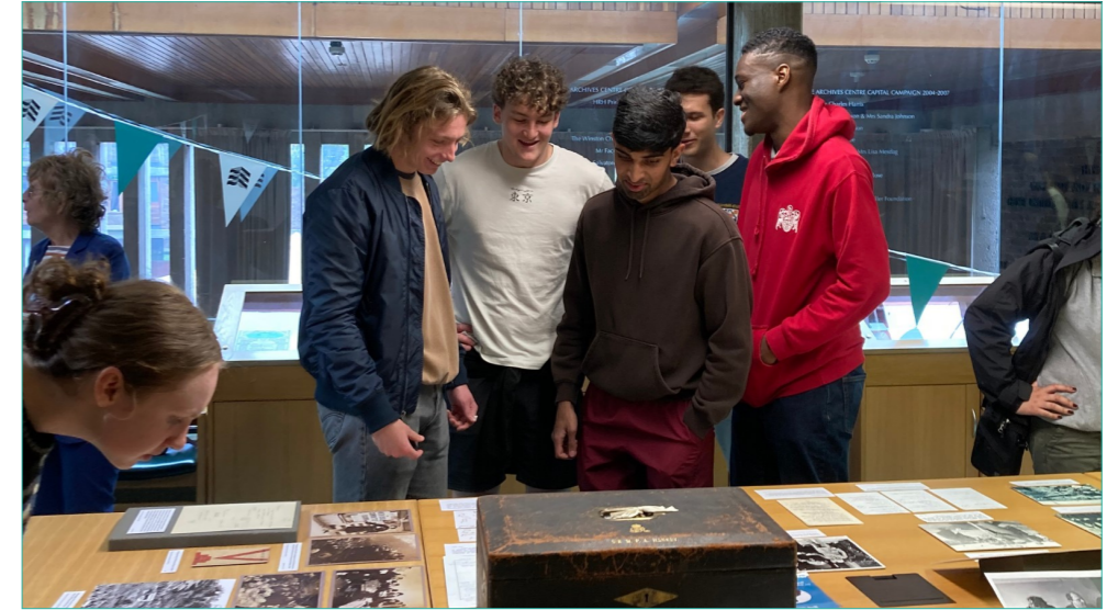
Visitors to the Open Day

Head: Republic of Ireland Department, FCO, 1997–99; Devolved Administrations Department, 1999; Consul General, Boston, 1999–2003; Counsellor, Cabinet Office, 2003–06; High Commissioner, New Zealand, Governor (non-resident) of Pitcairn, and High Commissioner (non-resident), Samoa, 2006–10; FCO, 2010–12; Governor and Commander-in-Chief of Bermuda, 2012–16. Interview completed 2024.