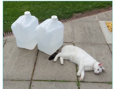
Weekly emptying of the dehumidifiers used to modify conditions in the stores, joined by the 'College' cat.

Further simple modifications may be made in the short to medium term before we start on a major refurbishment of the Archives Centre or the construction of a new building. In either case, largely passive storage will be the goal.