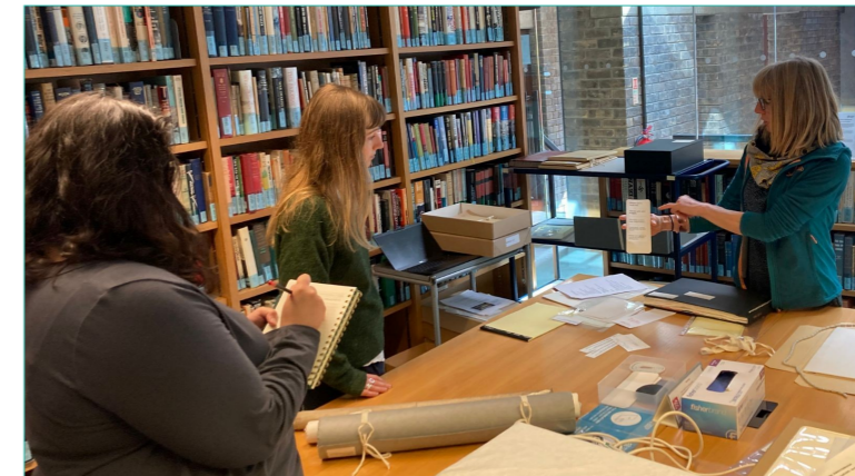
Our new Archive Assistants being trained in safe handling