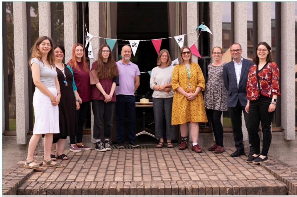
The Archives Centre team marking the 50th anniversary of Churchill Archives Centre on 26 July 2023

We would like to extend a huge thank you to everyone who has joined us in our anniversary celebrations over the last year. To find out more about our 50th anniversary, please visit https://archives.chu.cam.ac.uk/50th-anniversary-of-the-archives-centre/ .