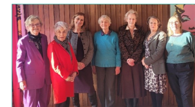
The Groundbreakers at Churchill College