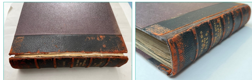
The Bull scrapbook before and after repair

Book conservation work was also performed on bindings in the collections of Sir William Bull (BULL) and Sir John Cockcroft (CKFT). A scrapbook in the Bull collection was in poor condition with detached boards. The repair included inserting a new joint under the spine, extending under the board leather, and dyeing it to match the original.