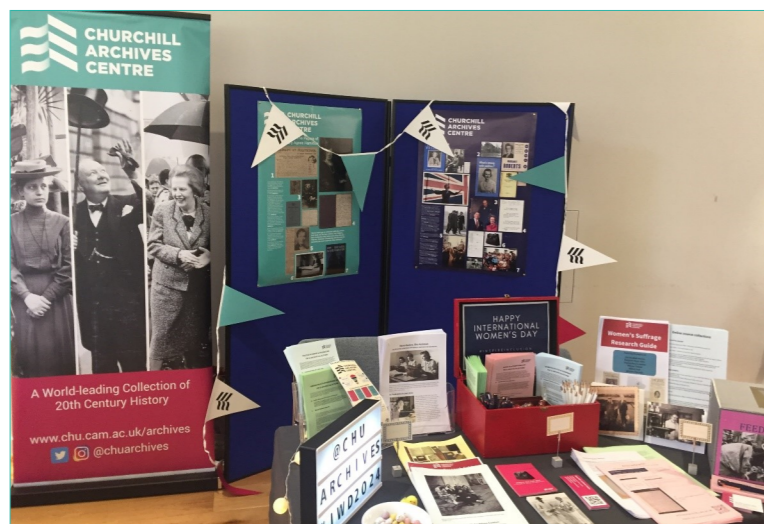
The display at the Cambridge Dissertation Fair