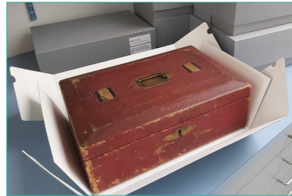
Drop-side boxes with padding and magnetic fasteners allow display without direct handling

Many bespoke packages and boxes have been created as usual, including an enjoyable project to house some of our ministerial despatch boxes, which are often used for visiting groups. Another bespoke mount and box was made for the pen that signed the Armistice in 1918 (BRDW V 5/1)