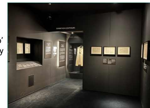
The letter on display in Gabrielle Chanel. Fashion Manifesto .

One of this year's highlights was the inclusion of a letter from our collections in the V&A's blockbuster exhibition, Gabrielle Chanel. Fashion Manifesto (16 September 2023-10 March 2024), the first UK retrospective dedicated to the celebrated designer's work. The letter from Gabrielle 'Coco' Chanel to Winston Churchill, sent from Madrid in December 1943 or January 1944, told a vital part of Chanel's wartime story. In an event at the V&A, Chanel biographer, Justine Picardie, cited her discovery of the letter as one of the most significant moments in her research. The mysterious and contested circumstances surrounding its writing were further explored in the BBC documentary, Coco Chanel Unbuttoned and the Apple TV series, The New Look .